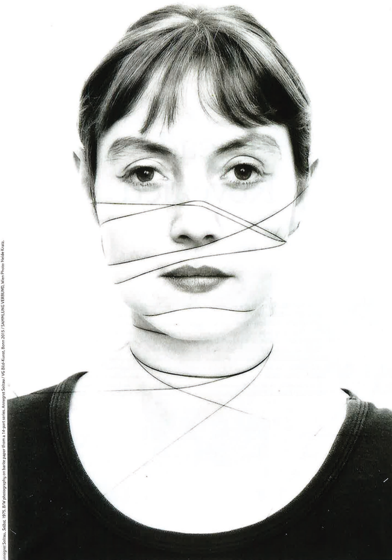
Annegret Soltau, Selbst , 1975. B/W photography on barite paper from a 14-part series. Annegret Soltau / VG Bild-Kunst, Bonn 2015 / SAMMLUNG VERBUND, Wien.